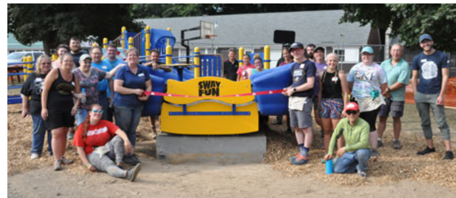
Over 60 volunteers joined us throughout the day to build the new playground and celebrate Camp Wawbeek's 80th Anniversary!