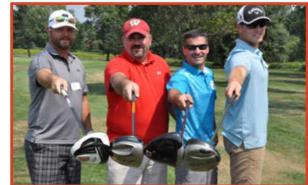
One of the teams from SD Ellenbecker Properties.