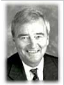
Easter Seals Receives Special Gift