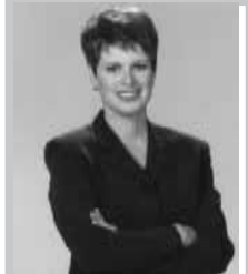
New Board Members